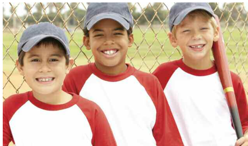
More than 38 million kids take part in organized sports

Kids’ sports injuries can range from scrapes and bruises to serious brain and spinal cord injuries. According to the National Institutes of Health, some of the common types of sports-related injuries in children are sprains and strains, bone injuries, repetitive motion injuries and heat-related stress. Nearly 40 percent of all sports-related injuries treated in hospital emergency departments are among kids ages 5 to 14, but the rate and severity of sports-related injuries increases with each birthday.