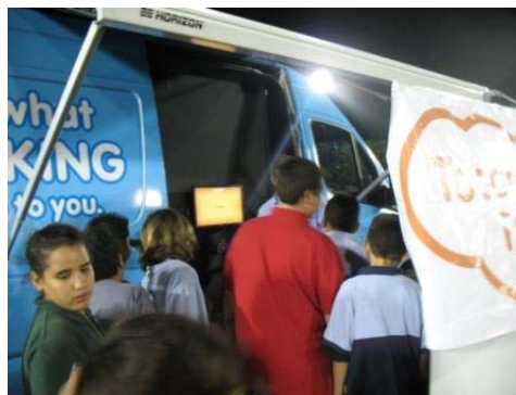
Smokifier van from Tobacco-free Florida