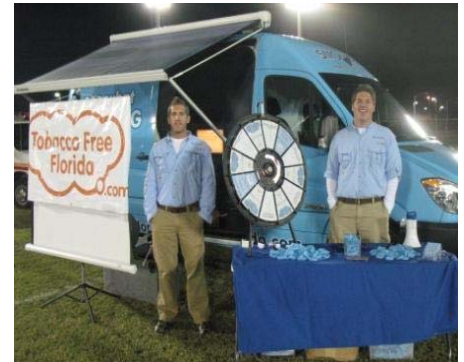
Zimmerman Agency Street Team and Tobacco-free Florida

explore the City of Hialeah Command Unit, and participate in activities offered by the Smokifier Van.