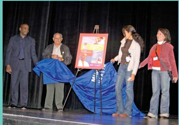
Our official Health Department poster was unveiled.

Employees expressed their satisfaction with the event and have already shared their ideas for 2010.