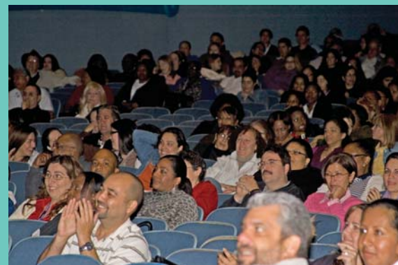
The retreat included useful information for employees.