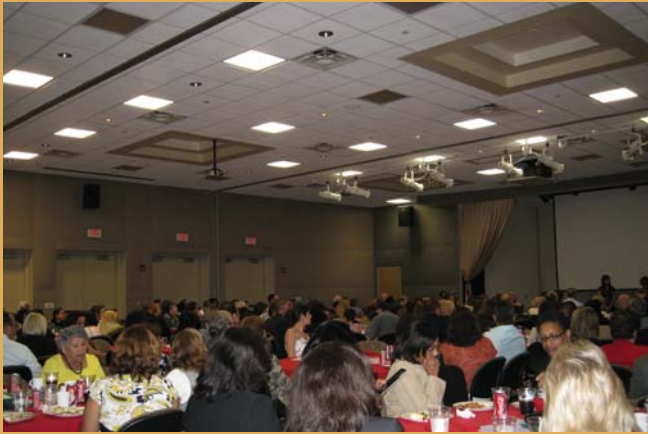
Volunteers from different organizations attended the reception.

The Miami-Dade County Health Department recently honored a group of volunteers, including doctors, dentists, healthcare personnel and local organizations that provide medical and dental services to uninsured and underinsured persons in our community. The reception was celebrated at South Miami Hospital.