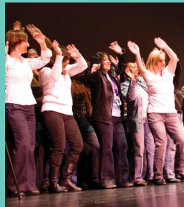
Employees share a moment of fun and dance.