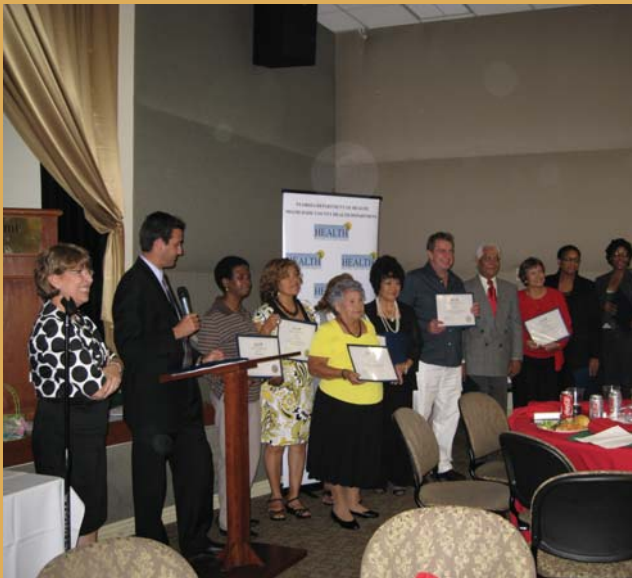
Participants received plaques and awards.