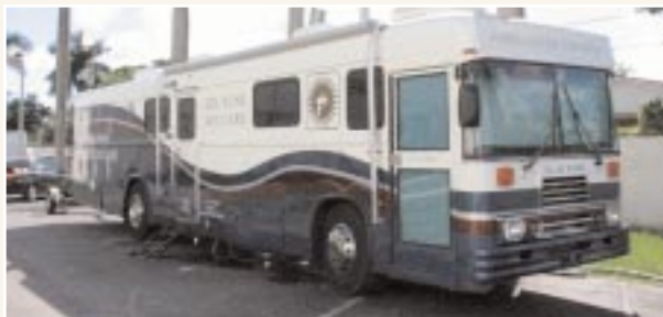
The Mobile Dental Van brings quality dental care to those unable to afford or commute to traditional dental clinics

For more information regarding the Mobile Dental Van call (800) 226-8584, extension 8251.