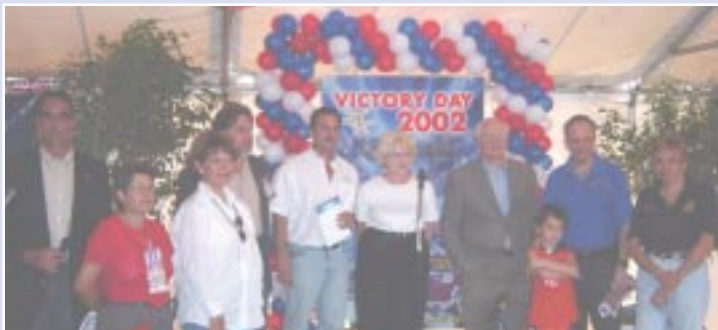
Victory Day sponsors are recognized onstage

A VIP reception, sponsored by PhRMA-America's pharmaceutical companies, was held on site. Many of the sponsors, including the Miami-Dade County Health Department, were present and received awards for their support of youth outreach and intervention services.